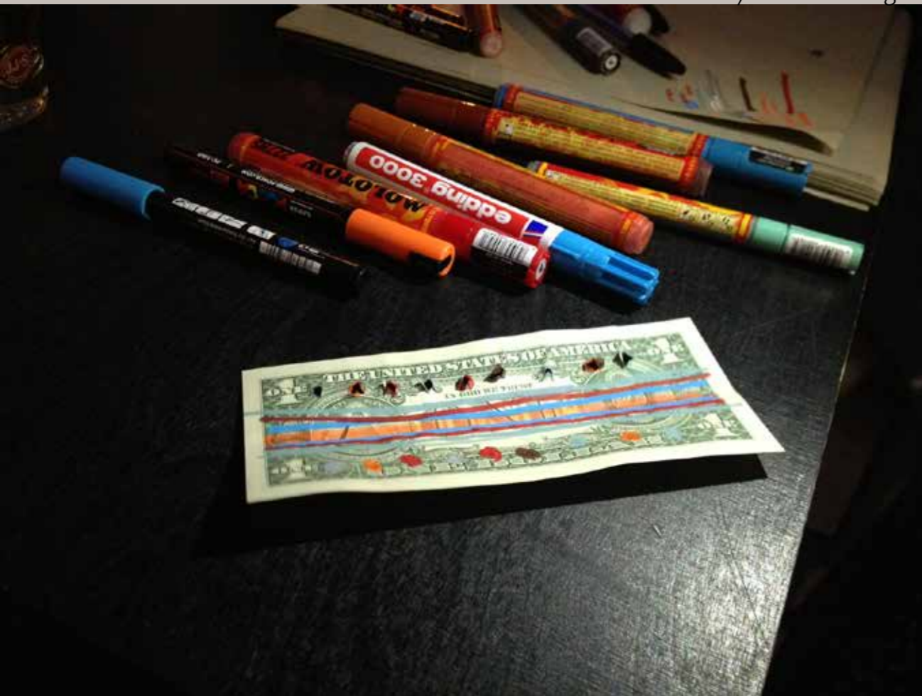
altered dollar note ready to be exchanged