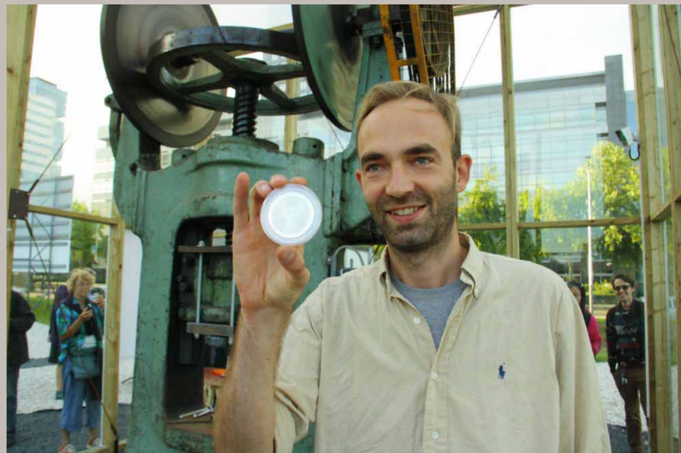
artist with a freshly minted coin