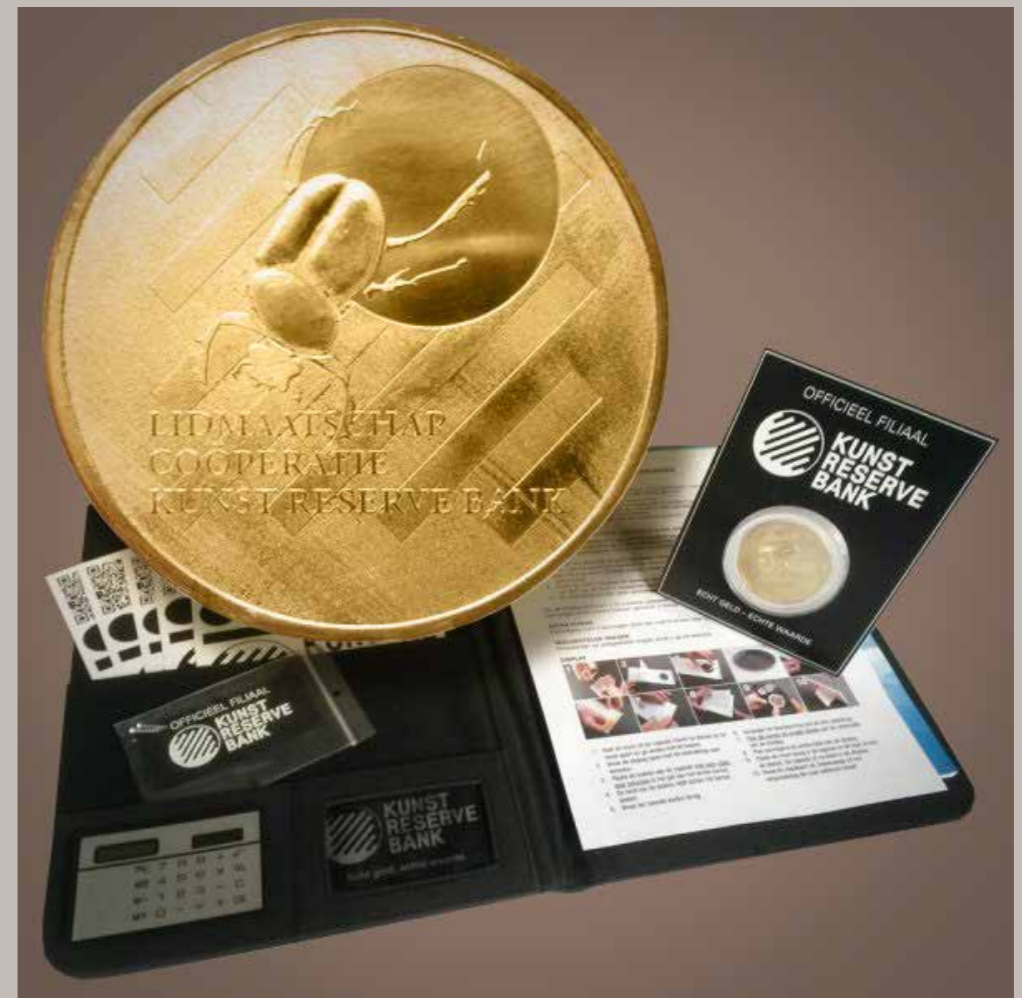
kit for branch managers