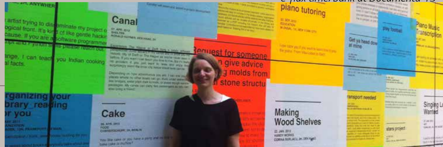
e-flux time/bank at Documenta 13