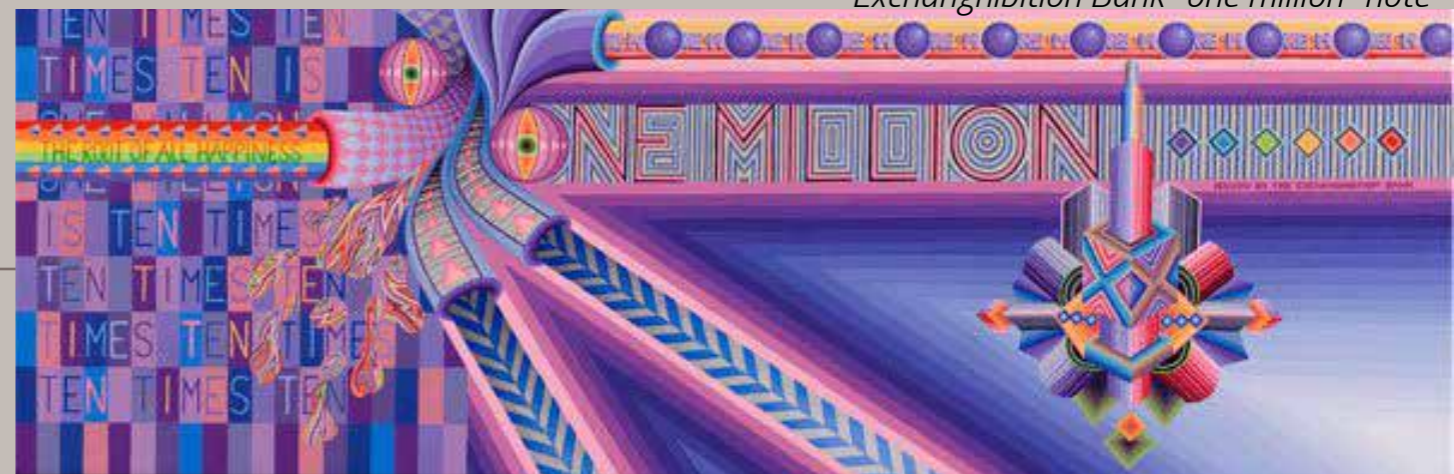
Exchanghibition Bank "one million" note