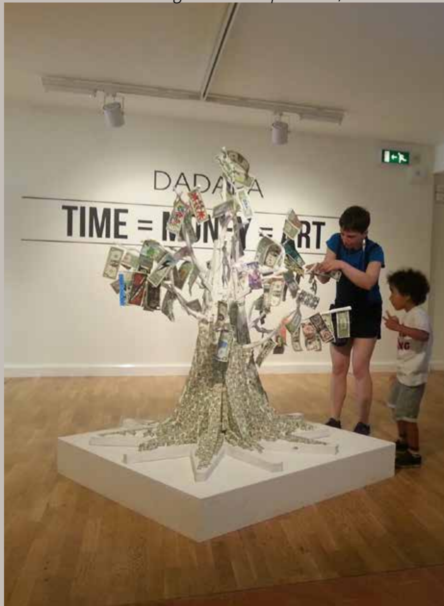
Birmingham Centre for Music, Arts & Culture