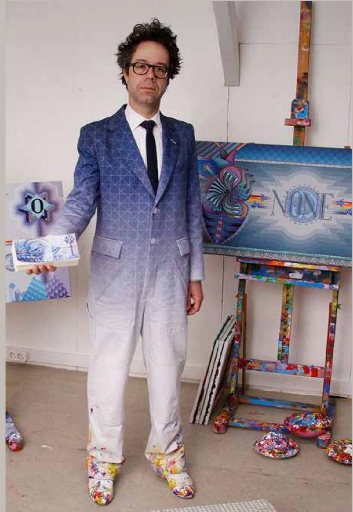
the artist with the "zero" note, front and back