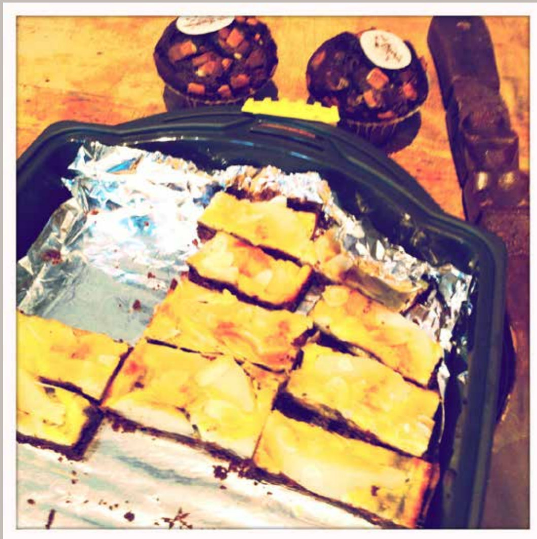
cake exchanged for time/bank hours