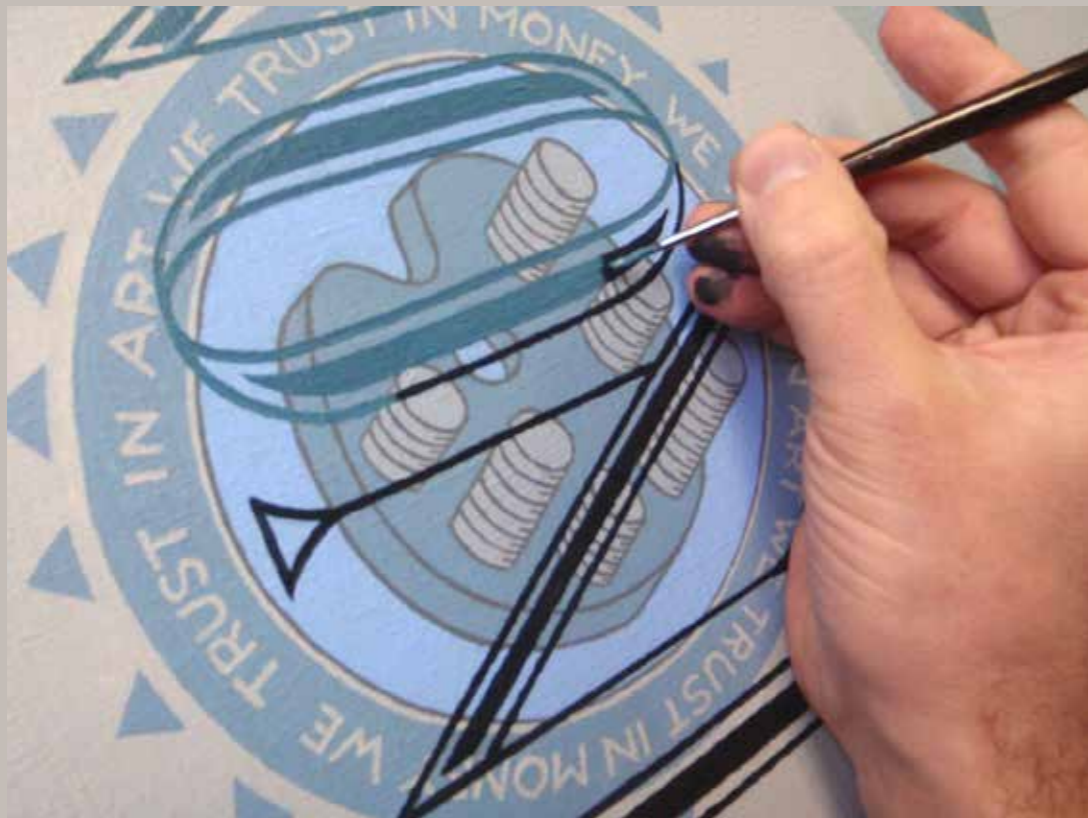
painting of the "zero" note