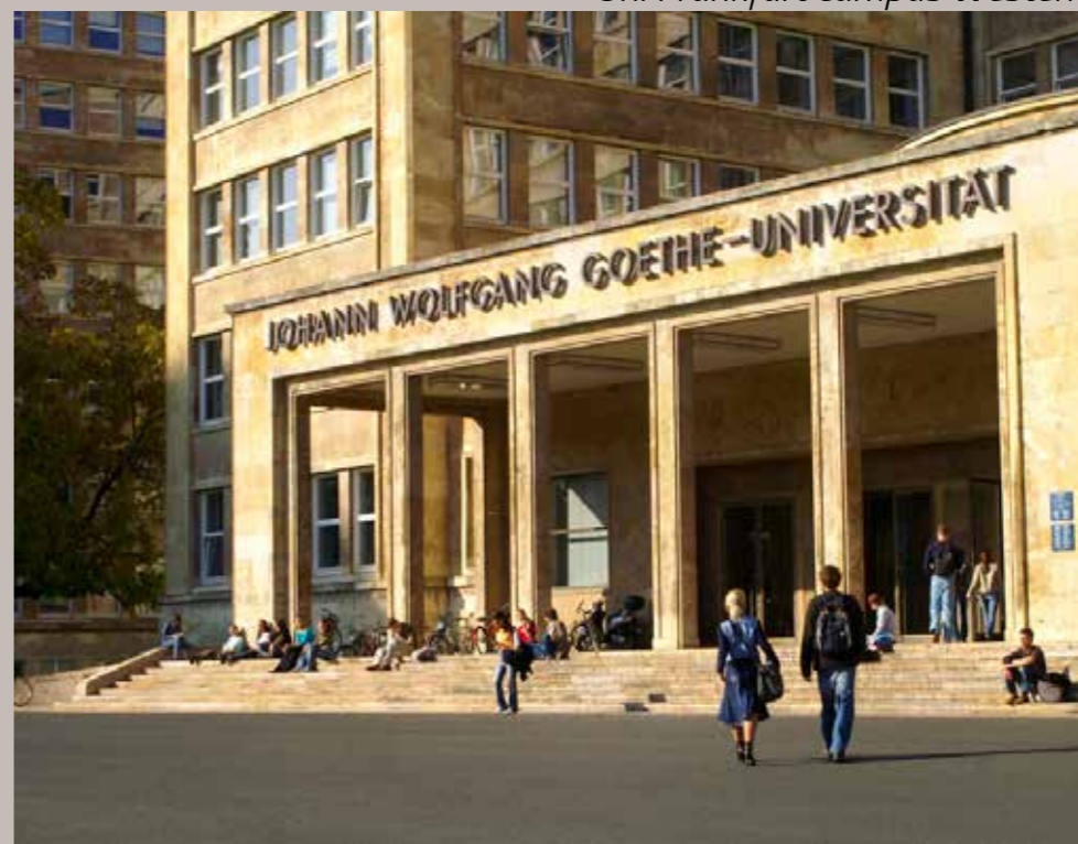
Uni Frankfurt campus Westend