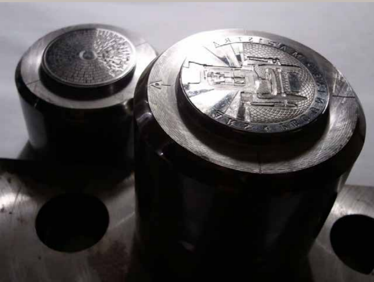
stamps for both sides of the coin

There is of course always a risk of a “bank run”, in which case the experiment will end. It's unlikely that the Dutch government will be willing to bail the bank out with public funds.