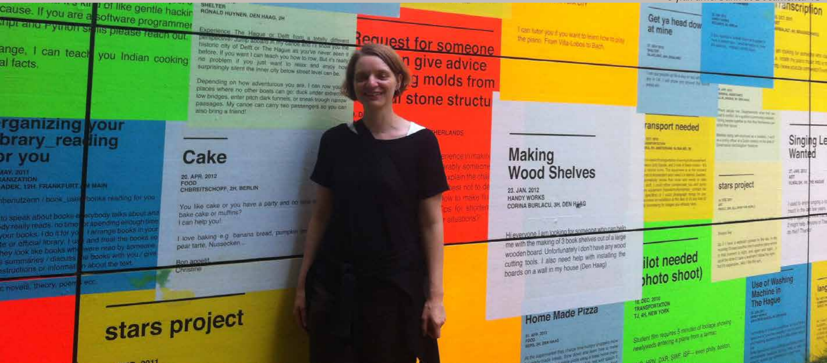
e-flux time/bank at Documenta 13