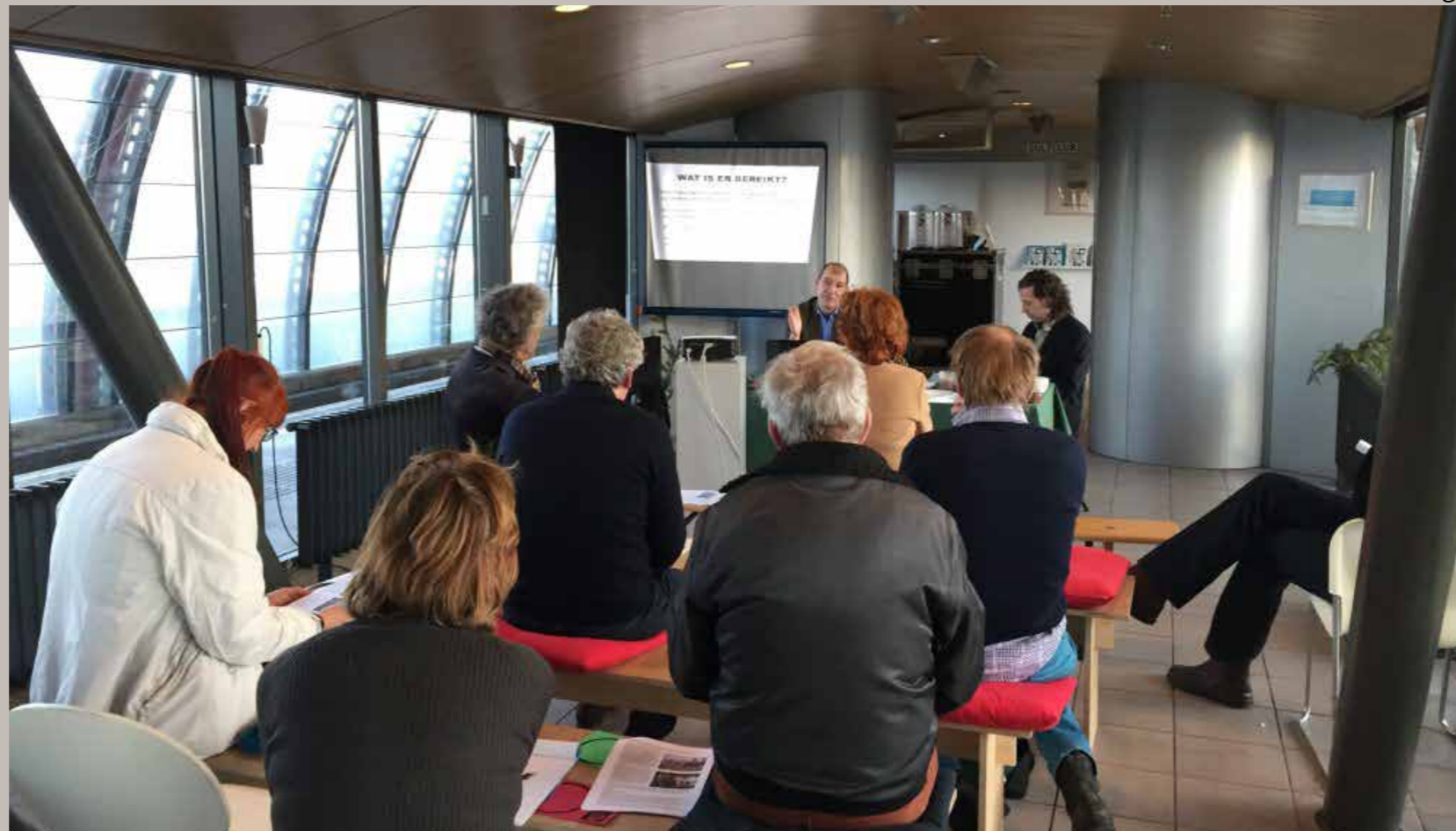
Art Reserve Bank 2014 board meeting

Besides investing in a work of art, anybody who buys a coin becomes a voting member of the cooperative bank and can decide its financial and artistic future at the yearly board meetings.