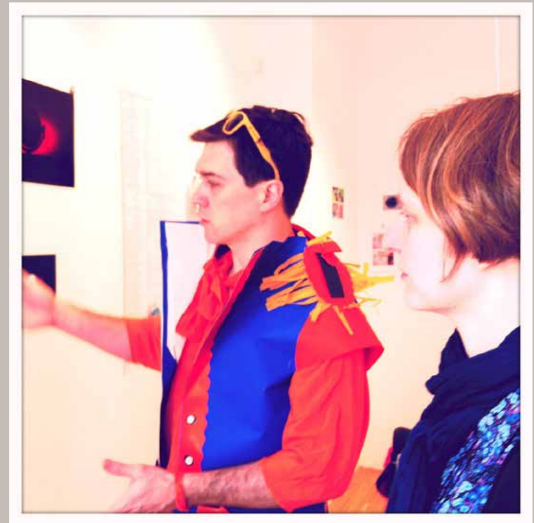
both parties of the exchange