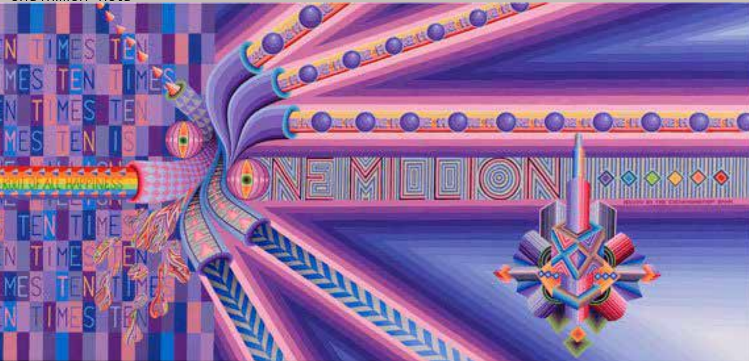
"one million" note