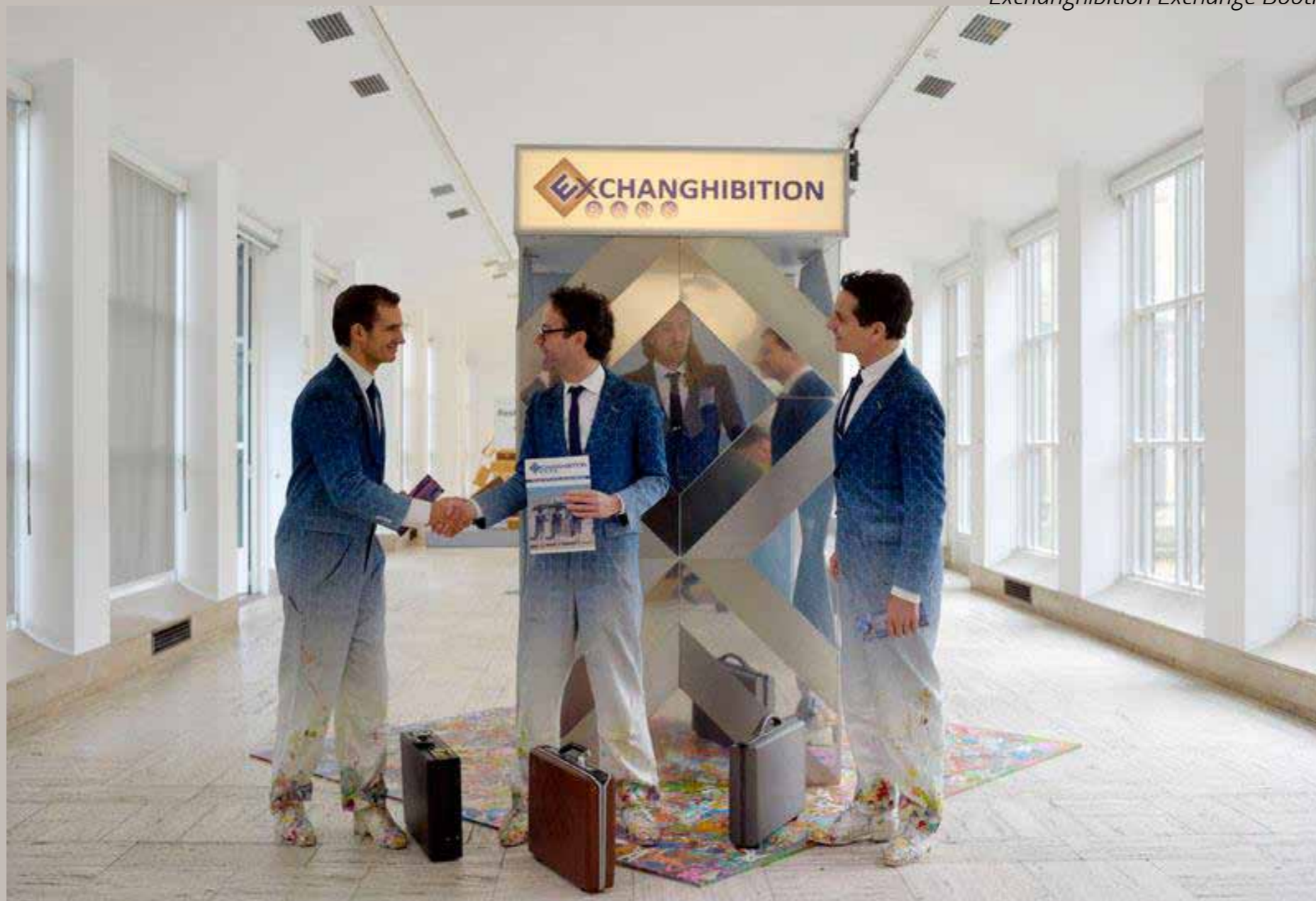
Exchanghibition Exchange Booth