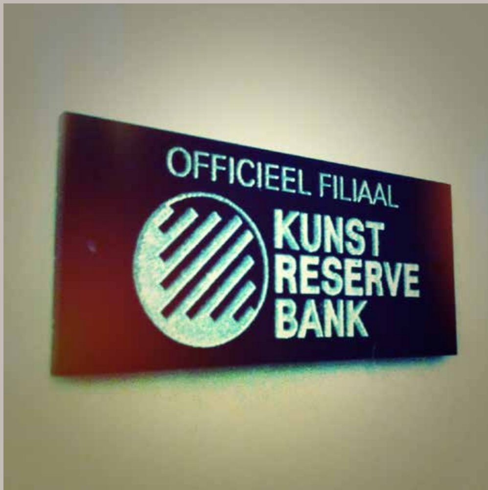
Art Reserve Bank Berlin branch