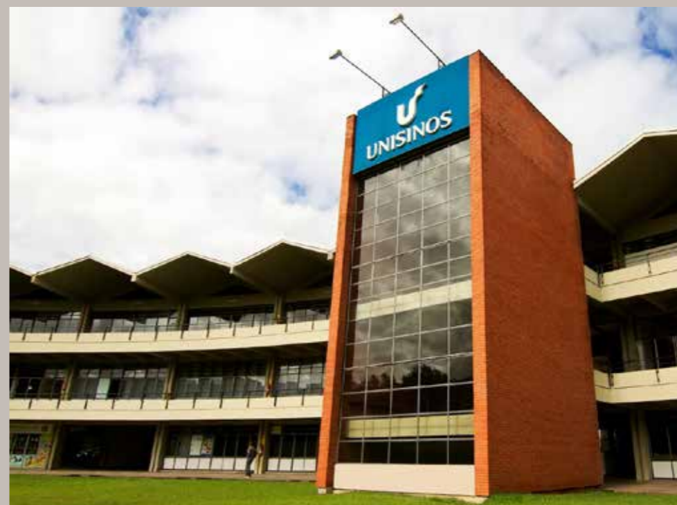
UNISINOS campus Sao Leopoldo